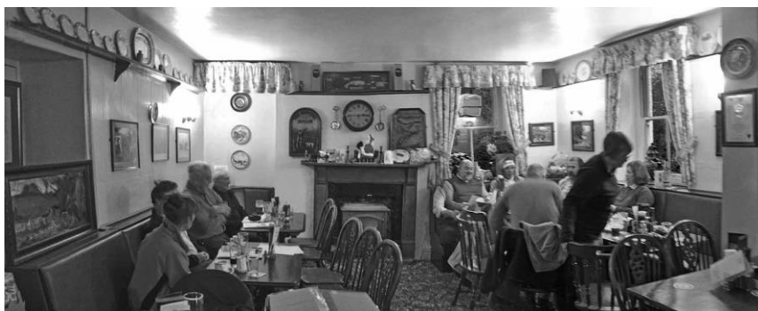
After the Bethlehem walk a pub lunch and a few hymns and arias (2009)