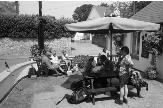
Swansea Ramblers enjoying a pub stop for lunch

The Ramblers' Association is a company limited by guarantee, registered in England and Wales. Company registration number: 4458492. A registered charity in England & Wales, no: 1093577. Registered office: 2nd floor, Camelford House, 87-90 Albert Embankment, London SE1 7TW.