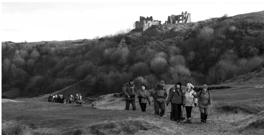
Boxing Day in Three Cliffs Bay, 2013