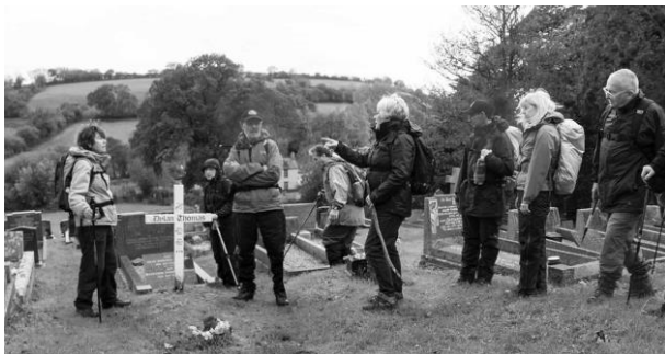
Swansea Ramblers at Dylan's grave

Exploring Dylan Thomas' birthday walk (see walk above for 25 th October). Dylan's 100 th birthday is on 27 th October 2014.