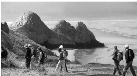
Pennard Circular (see 18 th October)